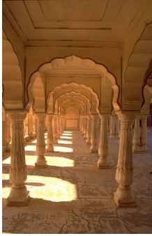
Caption describing picture or graphic.

"To catch the reader's attention, place an interesting sentence or quote from the story here."