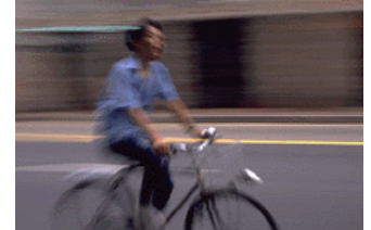
Caption describing picture or graphic.