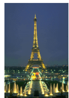
Caption describing picture or graphic.

Once you have chosen an image, place it close to the article. Be sure to place the caption of the image near the image.