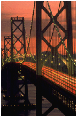
Caption describing picture or graphic.