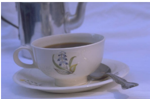
Caption describing picture or graphic.

"To catch the reader's attention, place an interesting sentence or quote from the story here."